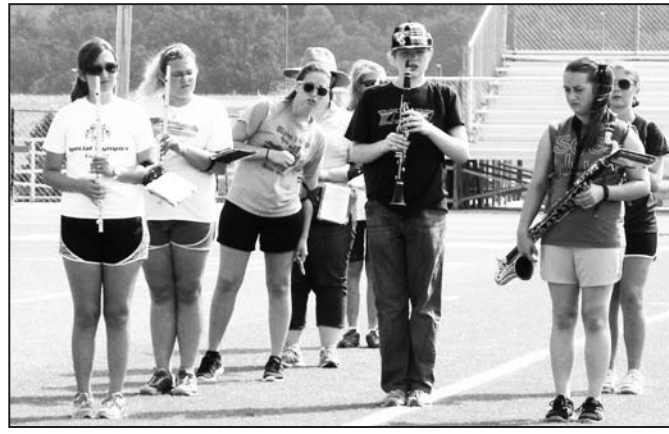
Pride of the Mountains' Woodwind Section