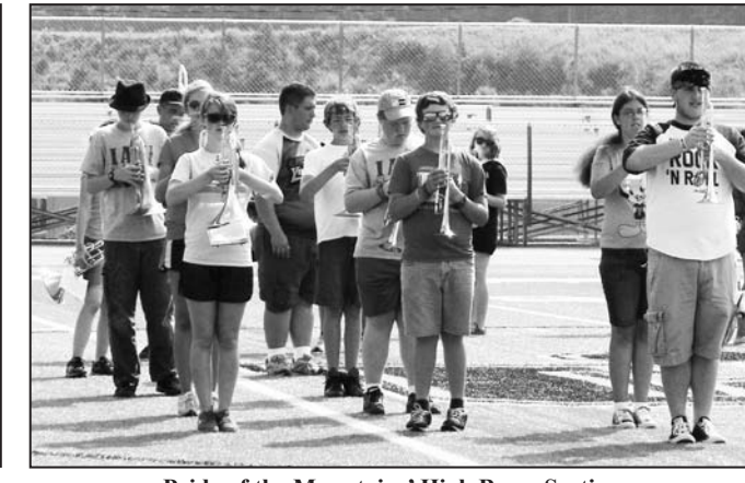
Pride of the Mountains' High Brass Section