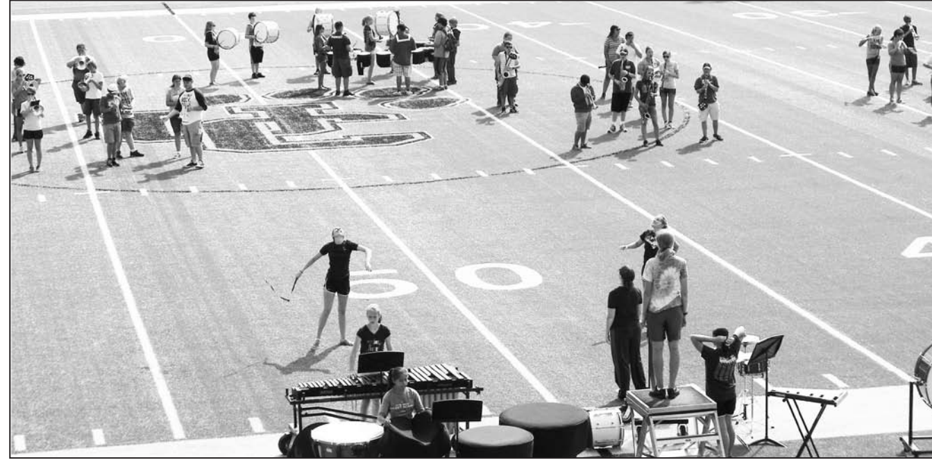
The Pride of the Mountains Marching Band is already preparing for the 2013-14 under the instruction of a new band director and drum major. Along with a new administration at UCHS, 'Change" will be the theme for this season.