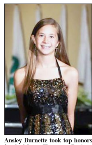
for the Master Horseman Project.