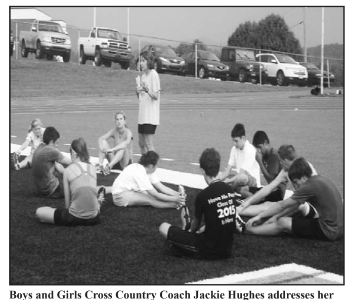
team during the team's first practice.

The girls return most of it's team from 2011 and have plenty of freshmen ready to