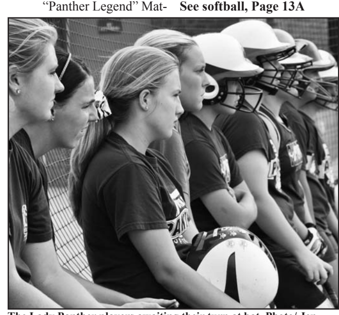
The Lady Panther players awaiting their turn at bat.