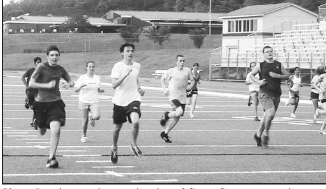
50-yard sprints on the opening day of Cross Country practice.

"If you get sore because you didn't stretch properly or didn't start drinking water until practice, don't come to me complaining because you're sore," Hughes said sternly. "Take stretching seriously, and you seniors need to make sure they take it seriously.