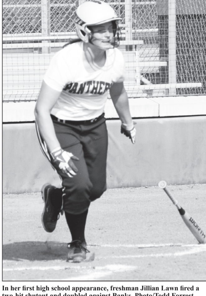
two-hit shutout and doubled against Banks.

Chambers dodged a bullet in Commerce's half of the fourth as two singles were wasted when a first when Crystal Busbee singled base running miscue derailed their