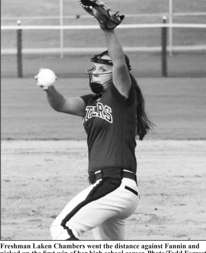
picked up the first win of her high school career.