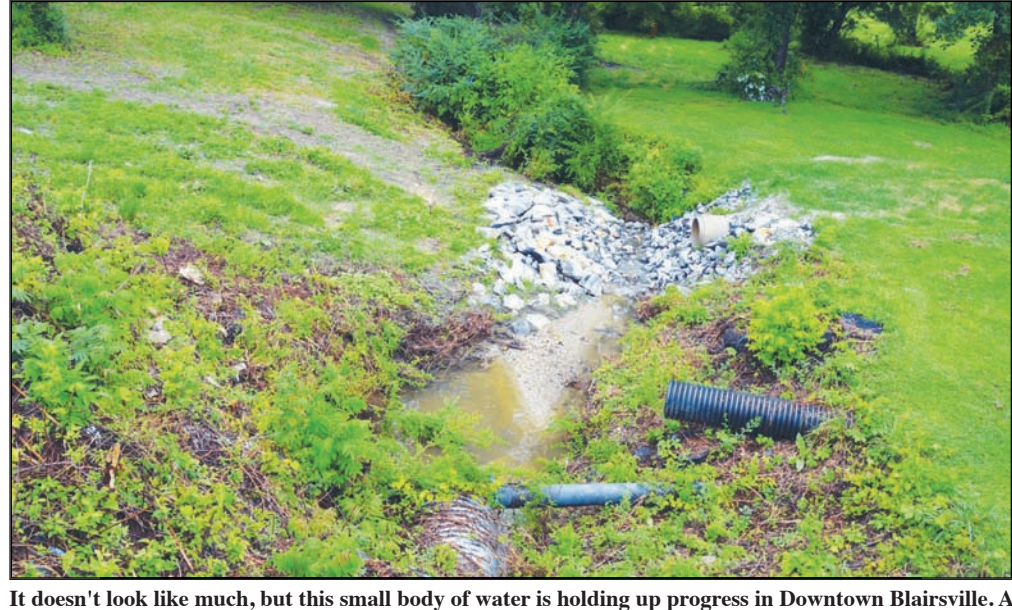
decision is expected soon to determine if this is a creek or wetlands.

new exit ramp from 515 that will let out further up on Pat Haralson Drive, as well as introducing bathrooms, parking, and green space for patrons, and open up more space for