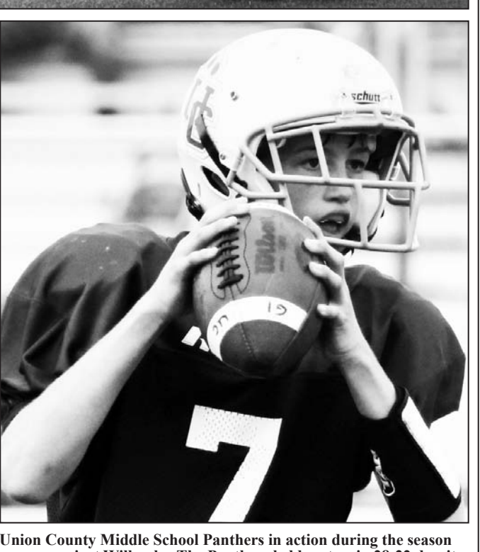
Union County Middle School Panthers in action during the season opener against Wilbanks. The Panthers held on to win 28-22 despite leading 28-0.

Kickoff on Thursday at "Our defense played re- Fannin County will be 5:30 p.m.