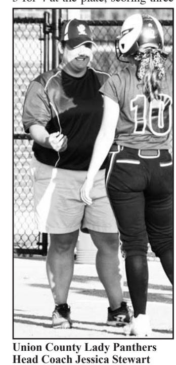
approaches her 200th coaching victory - all coming at UCHS.

Courtney Busbee went 3-for-4 at the plate, scoring three