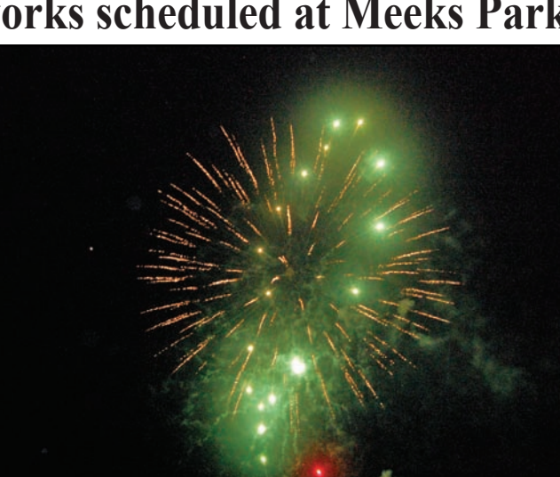
Locals hope the Saturday night sky will look like this.