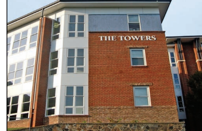
The Towers at Young Harris College.