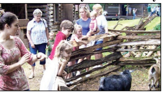
Farm animals are just part of the Heritage Festival experience. craft exhibits, blacksmithing,

The event, part of the Union County Historical Society, features life like it used to be, featuring farm animals,