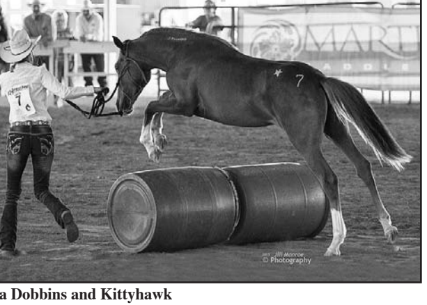
Jessica Dobbins and Kittyhawk

Only 27 adult and 13 youth trainers were accepted into the Challenge. The trainers picked up their assigned Mustangs in Mississippi 90 days before the competition. The horses had never been handled before being loaded into their trailers. All trainers were tasked with gentling and halter breaking their Mustangs;