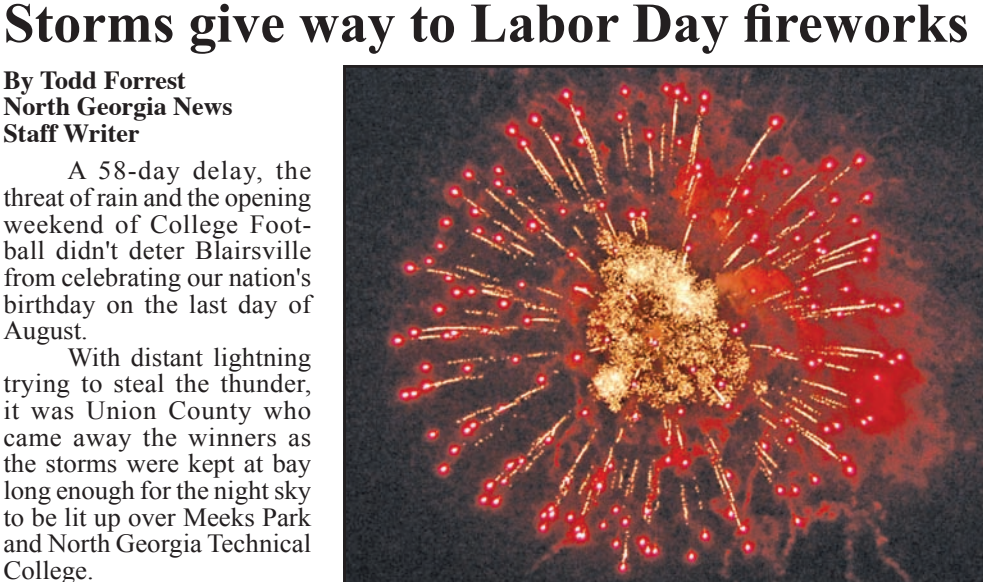
The storms held off long enough for the community to bring closure to the Fourth of July on Labor Day Weekend.

Both the Union County Sheriff's Office and the Union County Fire Department should be commended for keeping traffic moving along Highway 515 as most who ventured through Blairsville on Aug. 31st were left scratching their heads at the cars lining the highway and a jam-packed Meeks Park