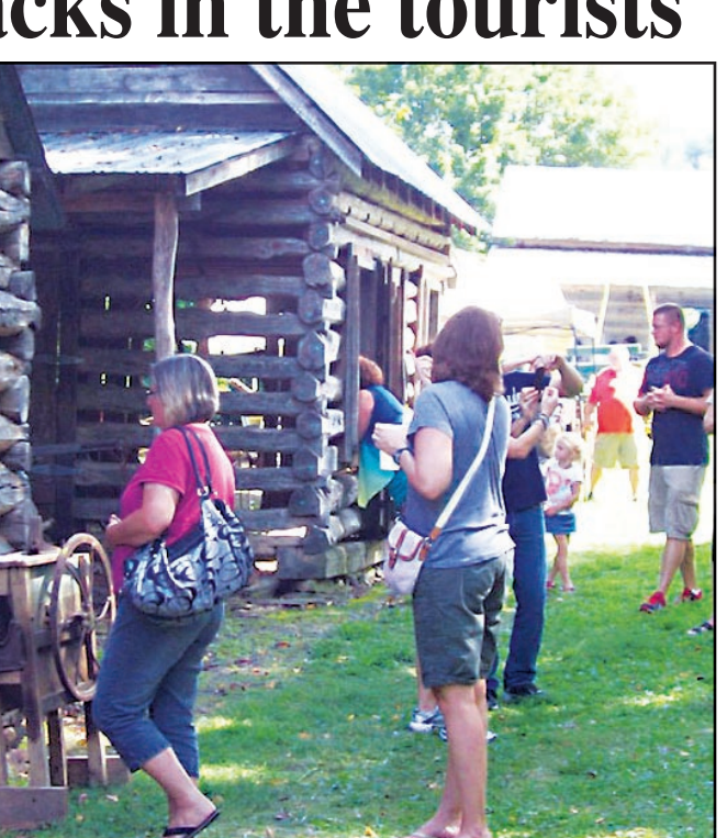
Locals and visitors alike came out Saturday and Sunday to get a glimpse of the native way of life in early Union County at the annual Heritage festival.

but mark your calendars and save the date.