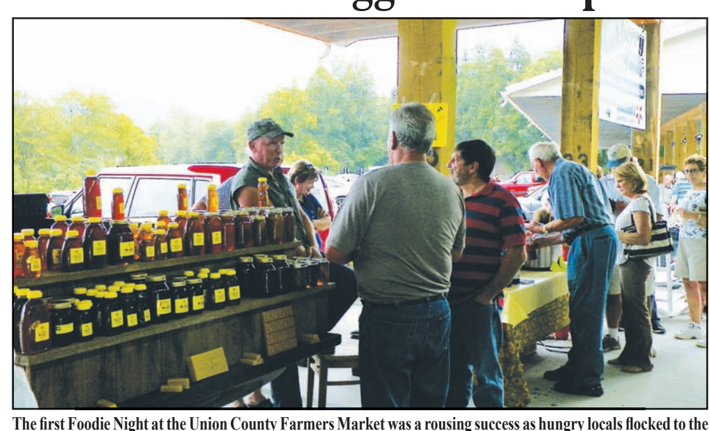
tasting event. Event organizers say the crowd turnout was larger than anyone expected.