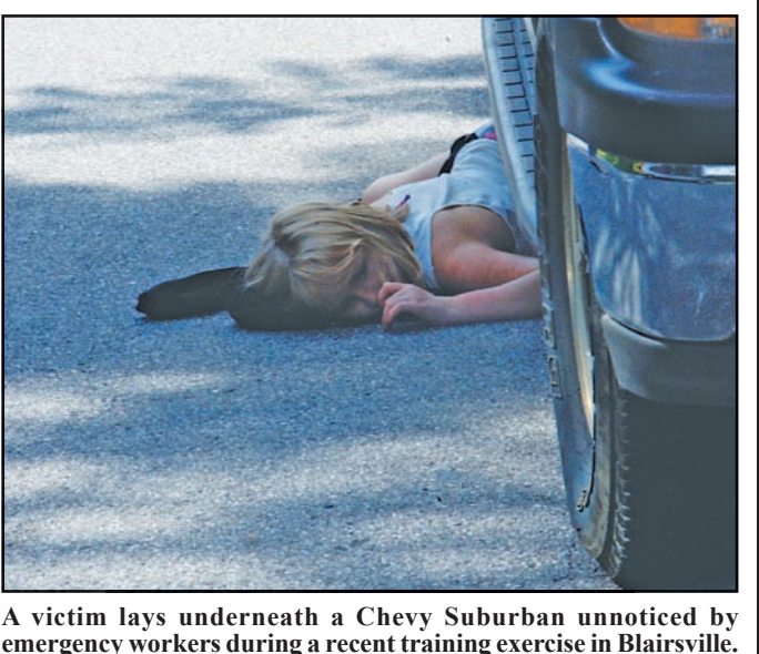
emergency workers during a recent training exercise in Blairsville.