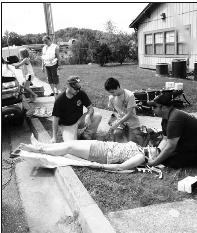
The accident scene is secured on Martin Street.

failed the exercise. The way they figured out that they failed the exercise, a young girl comes out of nowhere to tell the EMTs that she's dead and that they had overlooked