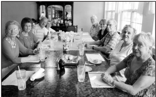
Regency Hospice - Dining with Friends