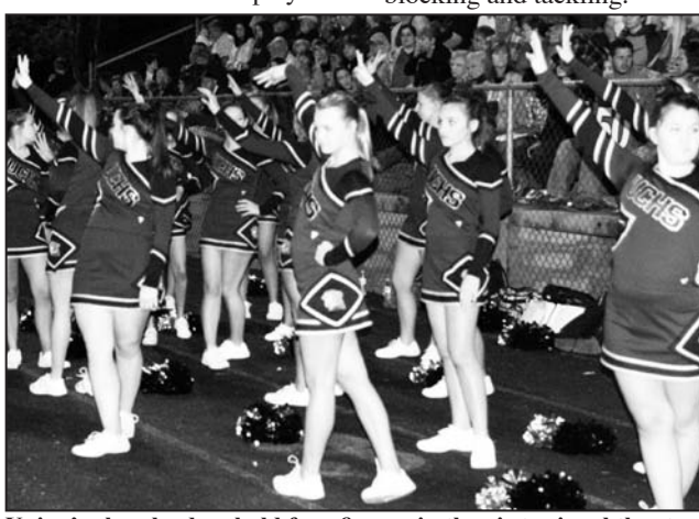
Union's cheerleaders hold four fingers in the air to signal the start of the fourth quarter.