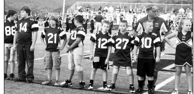
Union County's Recreation Department football teams and cheerleaders were recognized before the game.