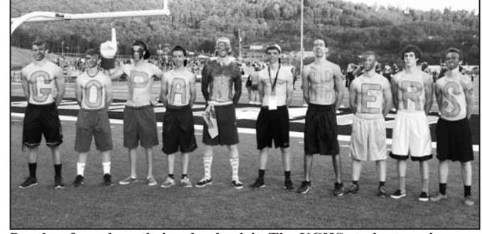
Panther fans show their school spirit. The UCHS student section remained vocal supporters throughout the game.

Two plays into Union's next drive, the Wildcats picked off a Bentley pass to set up a fourth down touchdown strike to knot the score at 14-14