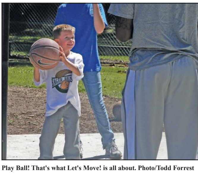
born today will reach adultphysical activity in children.

The goal: eliminate childhood obesity by the next generation so that children