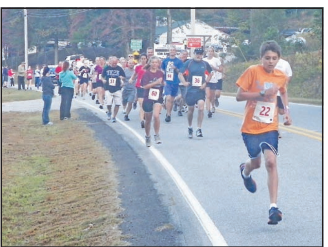
The Run Above the Clouds in Suches is a grueling 10K. Possibly, the most grueling 10K in the Southeast. programs and students at the Oct. 5th and 6th, from 9 a.m.