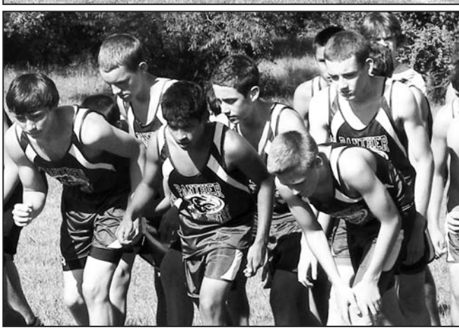
Union County Cross Country teams at the starting line last week in Murphy, NC.