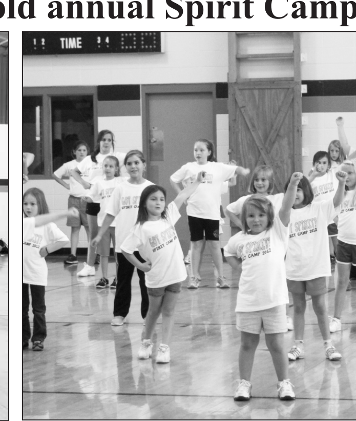
The Union County High School Cheerleaders held their annual Spirit Camp Sept. 17-19. More than 75 students, kindergarten through fifth grade, participated this year. The girls were divided into small groups to learn a cheer, chant and dance. Wednesday afternoon a showcase of what they learned was presented to the parents. A special thanks to Coosa Creek Embroidery for designing the T-shirts for the camp. The cheerleaders would also like to thank the administration and staff of Union County Primary School and Union County Elementary School for their help in making this year's camp a success.