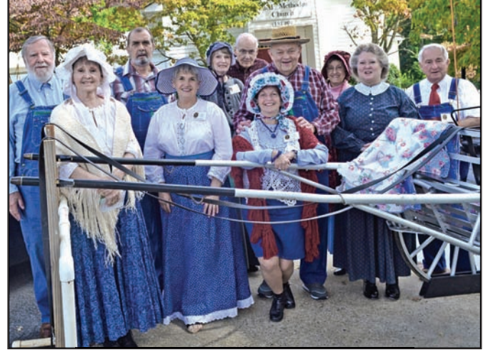
Homecoming at Coosa UMC brought out the antique clothing on Sunday as members turned back the clock.

Sept. 28 Sunday, marked the 180th anniversary of Homecoming at Coosa