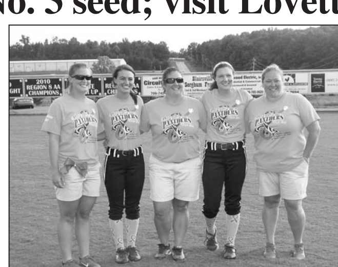
Seniors and coaches during the 'Pink Out' game.

as Region 8-AA Champions. Meanwhile, up in the at the plate with 2 RBIs and a mountains, Union County and triple.