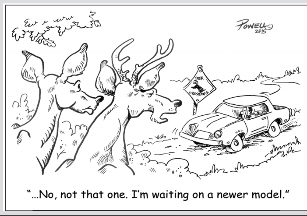
...No, not that one. I'm waiting on a newer model.