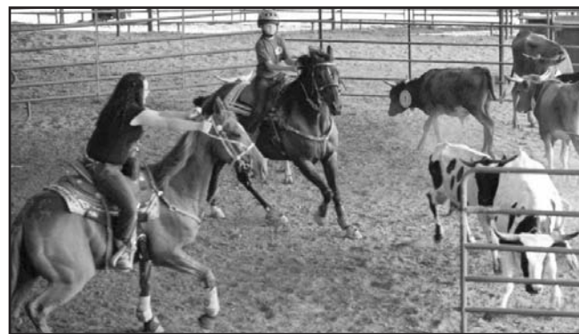
Ranch sorting is fun, challenging and gives horses a job to do

Anyone who wants to practice sorting can do so from noon until 3 p.m. on October 25. Cost for practice is $10 for all youth and for UCSC members, and $15 for all adult nonmembers. For each person who pays to practice on Octo-