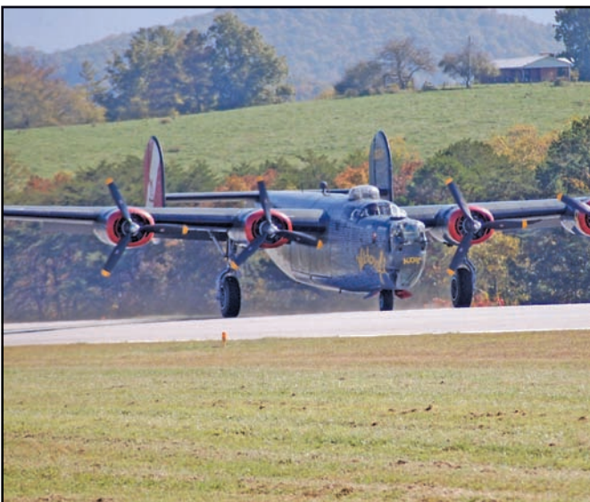
The Wings of Freedom Tour is underway at Blairsville Municipal Airport. arrived at Blairsville Municipal Airport on Monday.

More than 100 people greeted the warbirds as they