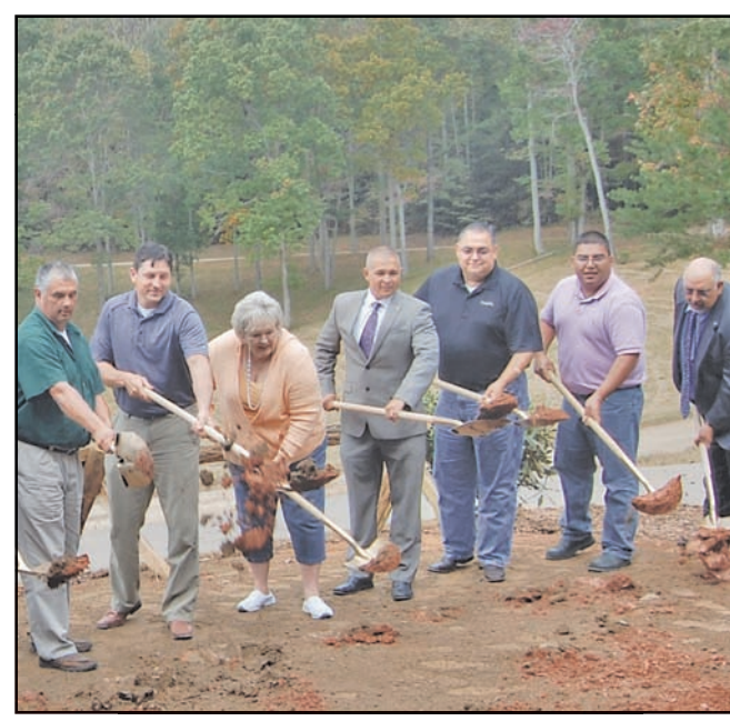
The Eastern Band of Cherokee Indians celebrate another casino, this time in Murphy, NC.

It also will target patrons from Knoxville and Chattanooga, Tenn., and the Metro Atlanta area.