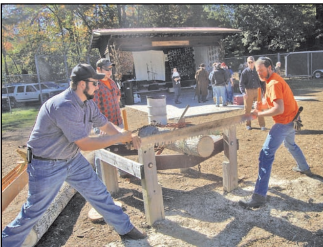
The Log-Sawing competition was a feature event this weekend.