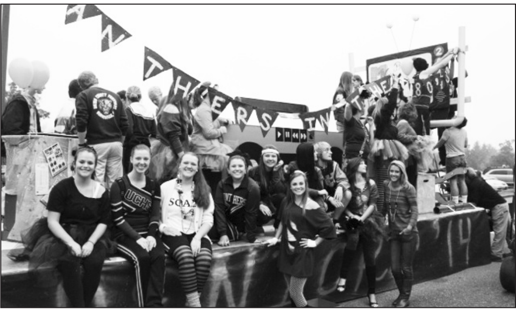
The Senior Class float