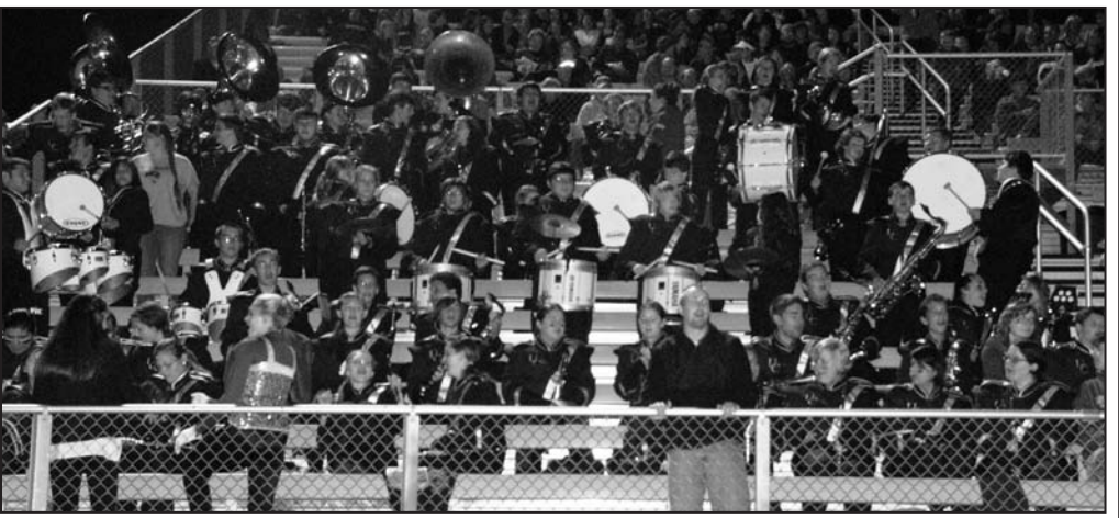
The Pride of the Mountains band takes a break to watch the action on the field.