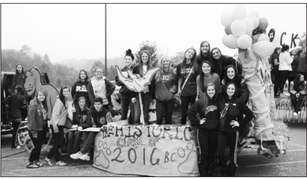
The Sophomore Class float.