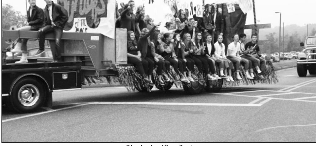
The Junior Class float