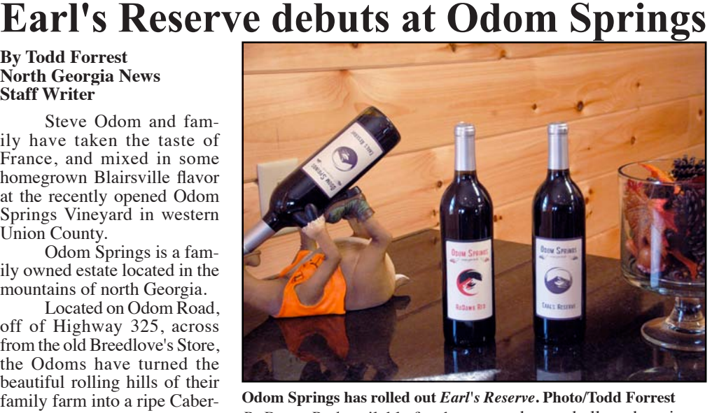
RoDawg Red available for the public to sample.

Last week, the vineyard was open for a wine tasting with Earl's Reserve and