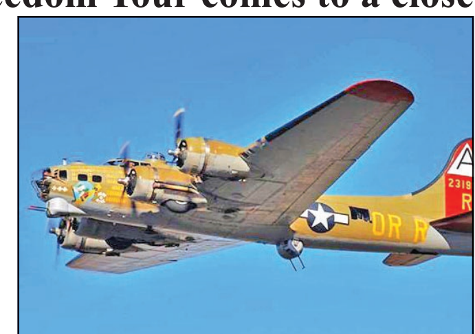
The Big Birds were flying last week at Blairsville Municipal Airport.

came to an end. Over the three days of the events, hundreds visited the Blairsville Municipal Airport's North Ramp to catch a glance of the elusive warbirds.