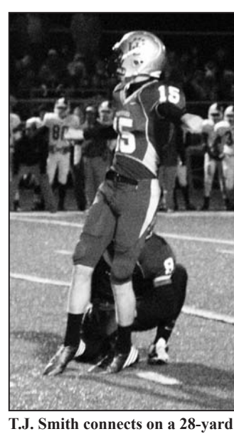
field goal.

Union went three-and-out and the Wildcats put the game