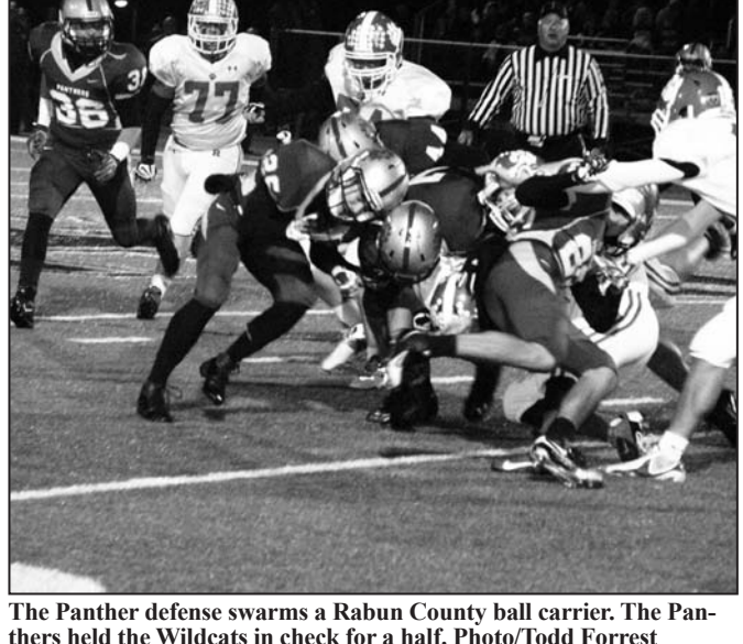
thers held the Wildcats in check for a half.

A punt gave the ball back to the Wildcats with 3:59 left in run. The extra point sailed wide the half where they went on a