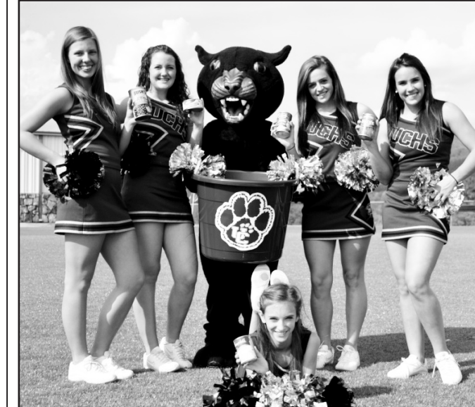
Union County High School supports Neighbor's Hand

The Union County High District Food Bank and other School Quarterback Club is teaming up with Neighbor's Hand, a local ministry, in sponsoring a canned food drive at the last home game of football