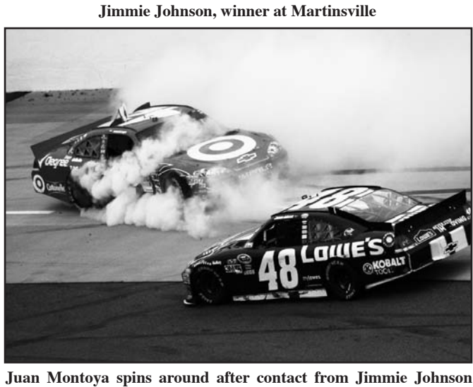
during Sunday's Martinsville Cup race. Furnished by NASCAR and is now 49 points behind