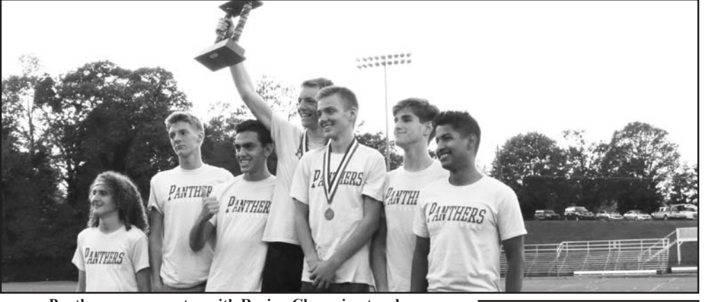
Panthers cross country with Region Champion trophy