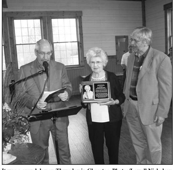
It was a grand day on Thursday in Choestoe.