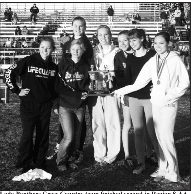
Lady Panthers Cross Country team finished second in Region 8-AA and is headed to state.

However it wasn't enough to overtake the Lady Dragons who claimed the second, third, fourth, fifth and ninth positions.