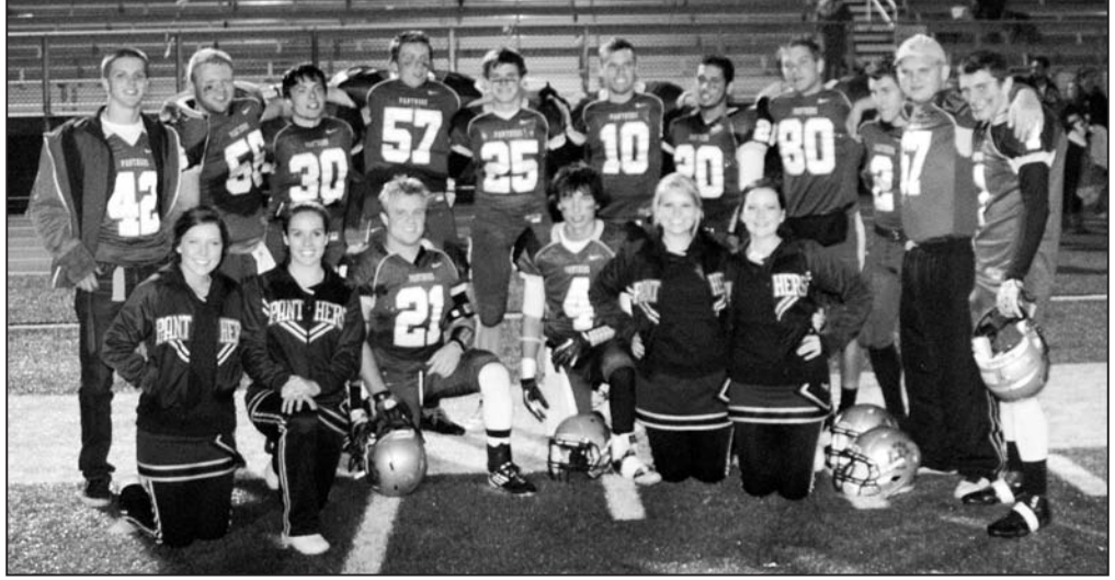
Panther senior football players and cheerleaders celebrate Senior Night.