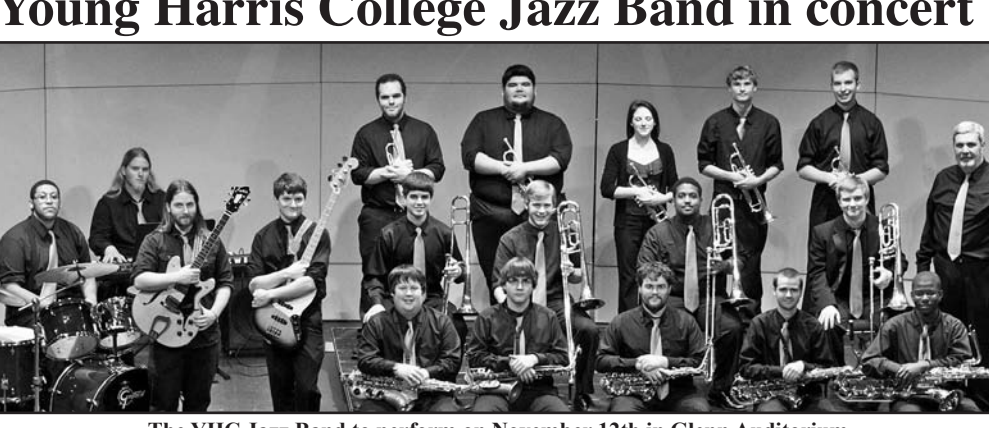
The YHC Jazz Band to perform on November 12th in Glenn Auditorium

Young Harris College's Division of Fine Arts will present the Young Harris College Jazz Band in concert Monday, Nov. 12, at 7 p.m. in Glenn Auditorium of the Clegg Fine Arts Building on the YHC campus. The performance is free and open to the public.