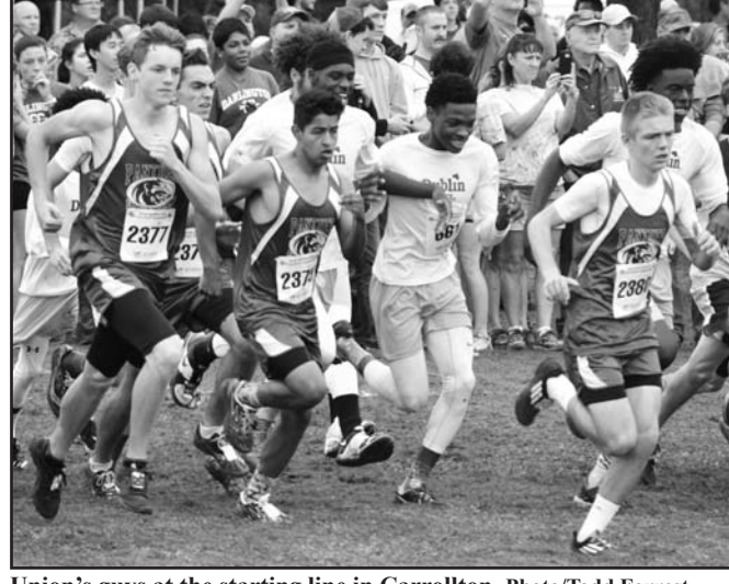
Union's guys at the starting line in Carrollton.