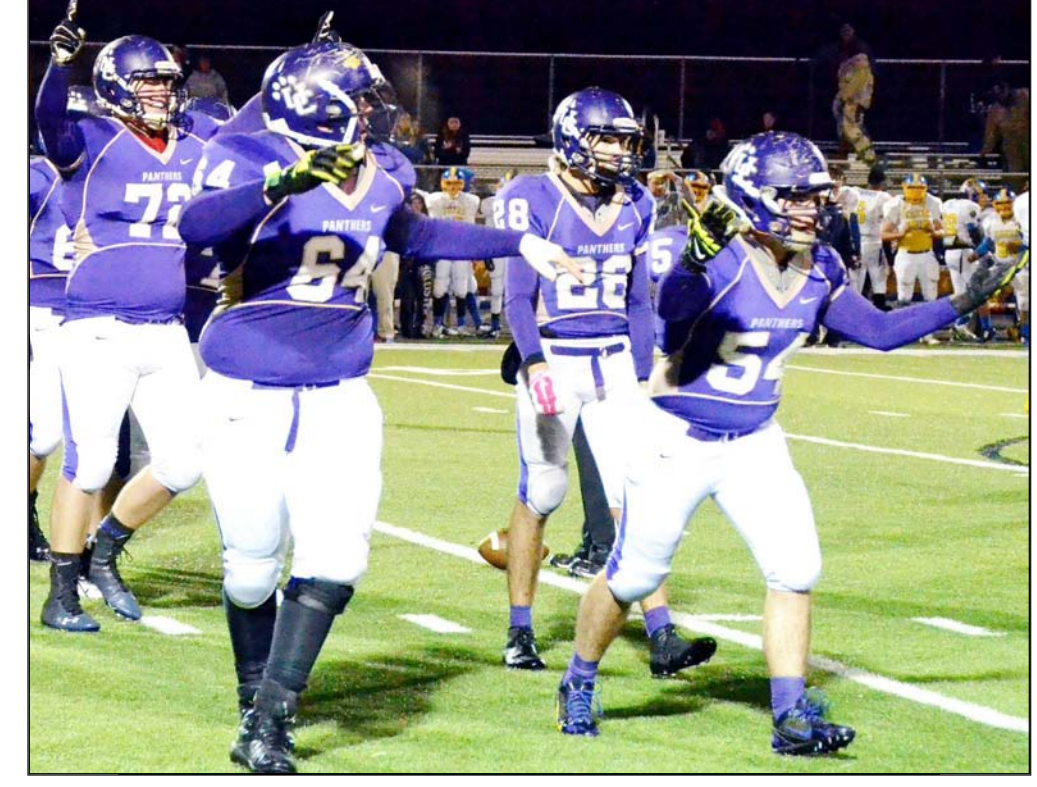
The Union County Panthers celebrate their first time to host the state playoffs since 2001.