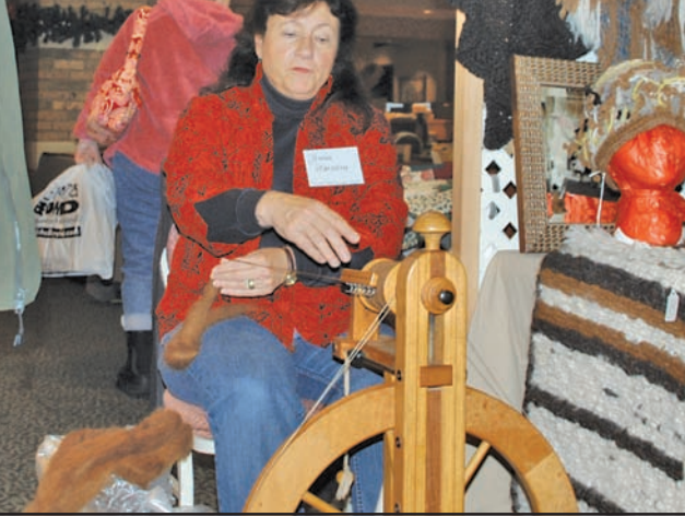
The excitement is building for the 13th Annual Mistletoe Market.