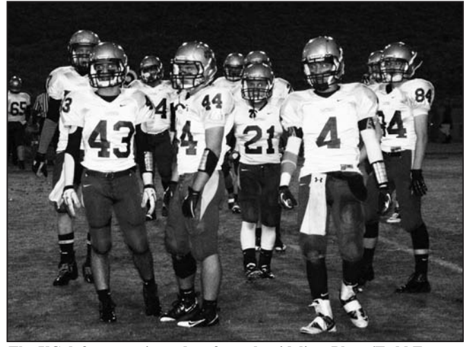
The UC defense awaits orders from the sideline.