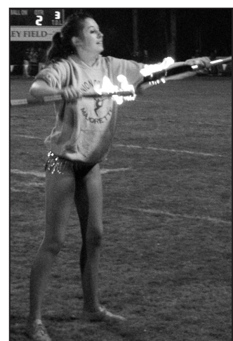
On the previous Thursday

Union defense smothered the Lion quarterback, resulting in a punt.