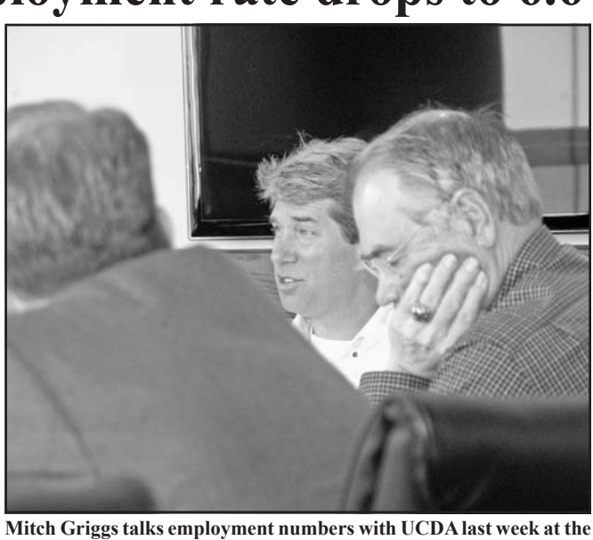
Union County Community Center.

"A lot of times, you can see an unemployment rate go down in a state because people have dropped out. They've given