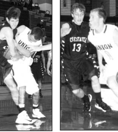
Covne battles for possession.