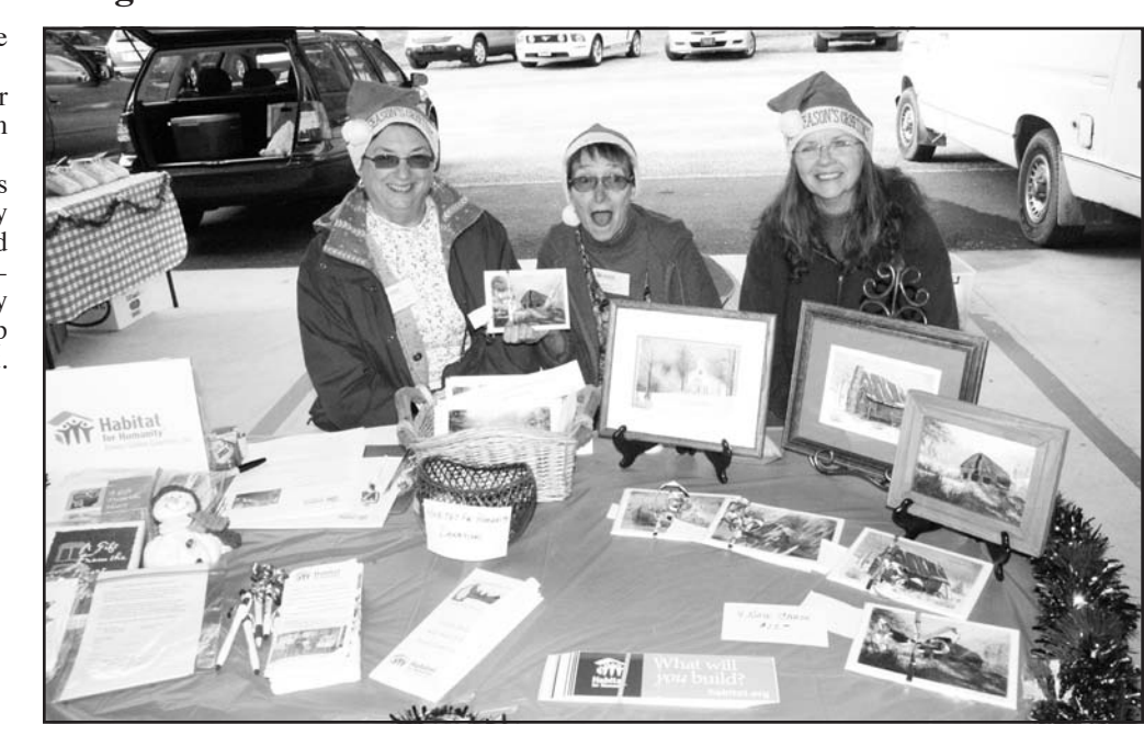
Santa's elves will be out in force on Friday and Saturday at Kris Kringle Market at the Union County Farmers Market.