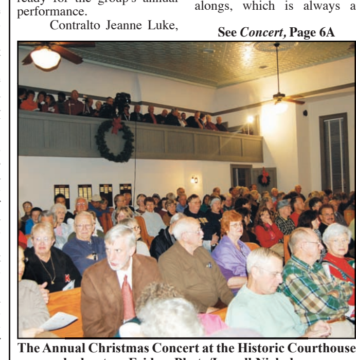
was packed out on Friday. Mock Trial

Vol. 103 No. 49 2 Sections, 24 Pages Weather Wed: Rain Hi 60 Lo 37 Thur: Clouds Hi 55 Lo 38 Friday Clouds Hi 52 Lo 44