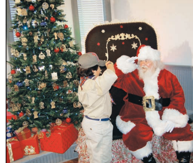
Santa gets a salute from a young Cub Scout on Saturday.