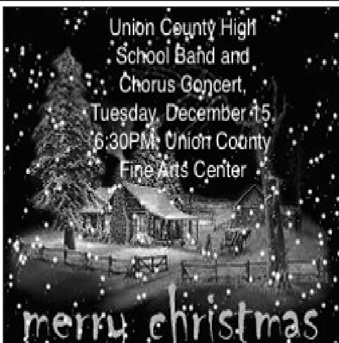
Union County High School Band and Chorus Concert, Tuesday, December 15, 6:30PM, Union County Fine Arts Center