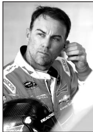
Kevin Harvick crew chief.

For the third time in four years, Danica Patrick has a new