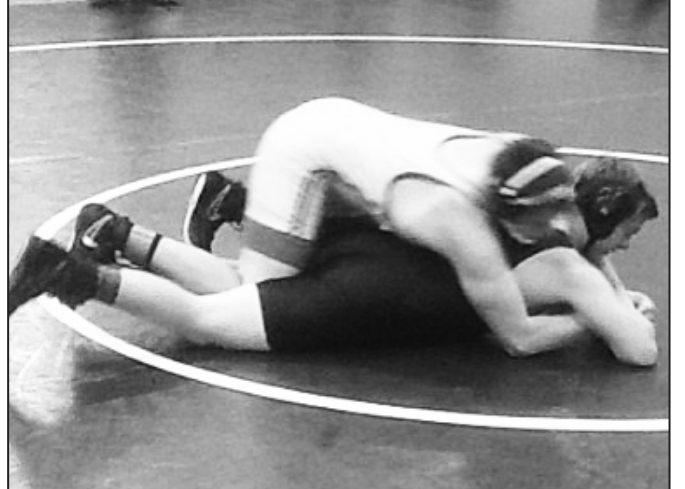
Tulsa Queen picked up two wins in the 195-pound weight class.

"We're still young. And when we make mistakes, they are big ones. They aren't one tionally well."