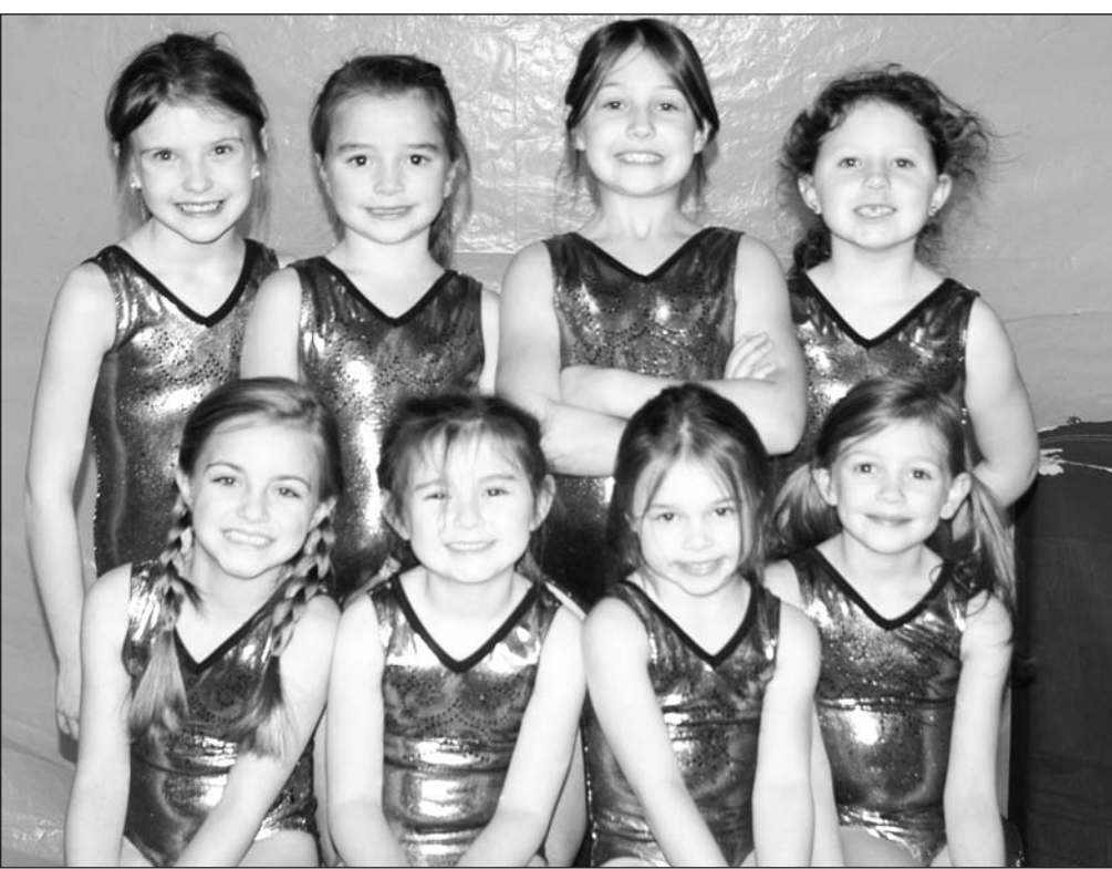
AAU Level 2