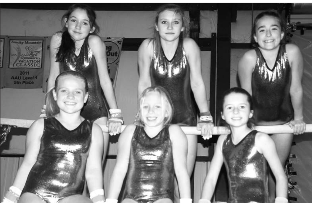
USA Xcel Gold