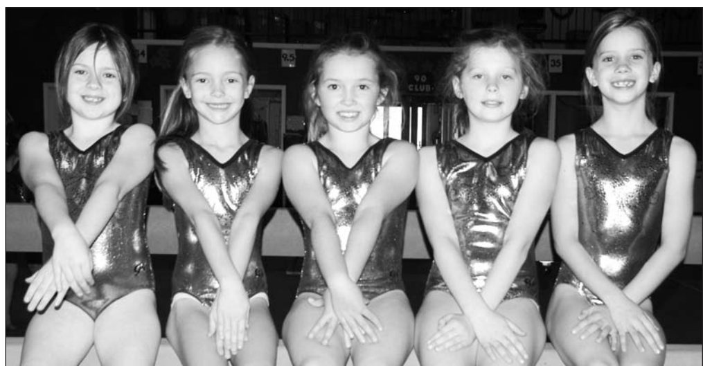
AAU Level 3