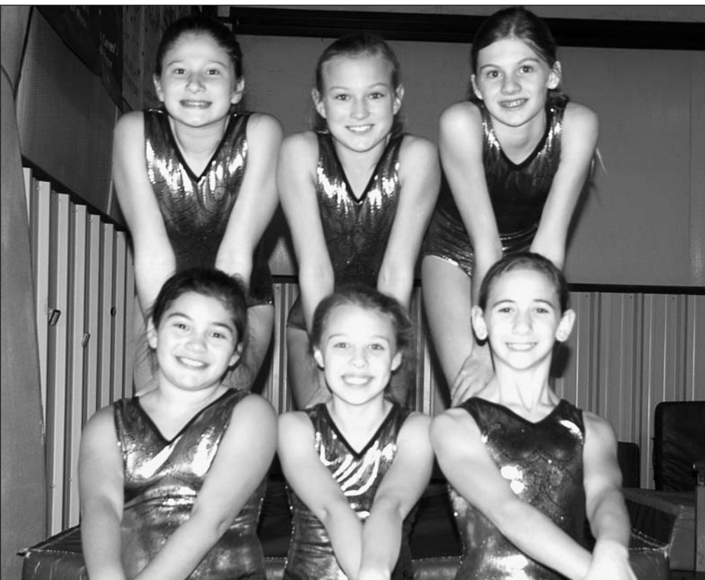
AAU Xcel Silver