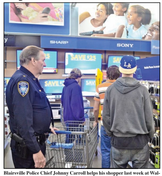
Mart during the 14th Annual Shop With A Cop.

Union County Family Connection, teachers and other sources point the prospective