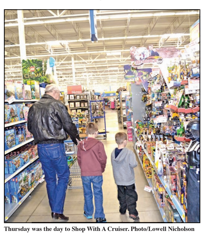
addition to Shop With A Cop. said. "We also have sponsors.

Throughout the year, the Blairsville Cruisers hold events to generate the necessary funds to support the program each December, in