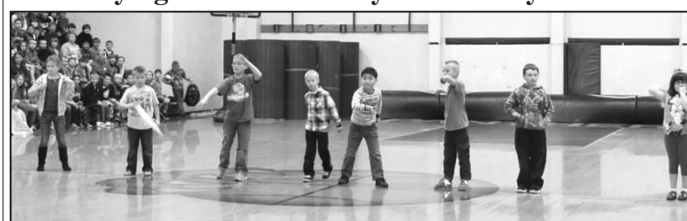
Elementary students participate in the final flights for paper airplanes

On Tuesday, November 24th the Union County Elementary students hosted the final flights for Paper Airplanes. All students made paper airplanes in STEM class the previous week and had a preliminary flight to find the one in each class that flew the farthest.